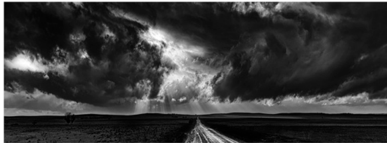
1st Place : "Yongala Cloudscape" Paul Pegler LAPS