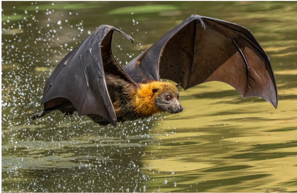
"Flying Fox Cooling Itself" William Shields AAPS Tea Tree Gully CC