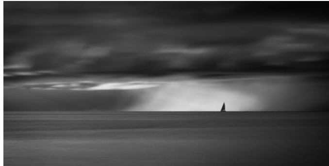
1st Place : "Sunset Sail" Alan Bevan AAPS