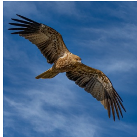
1st Place : "Whistling Kite overhead" William Shields AAPS