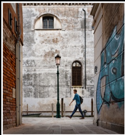
"After the Day is Done" - Jeanette Scales

The Atrium, City of Burnside Civic Centre 401 Greenhill Road Tasmore (Cnr Portrush and Greenhill Roads)