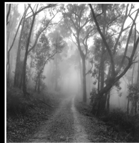
"Foggy Trail" - David Munro AFIAP FAPS

The Committee and Members of ESCC are delighted to showcase print images from our 65th Annual Exhibition held in December 2023.